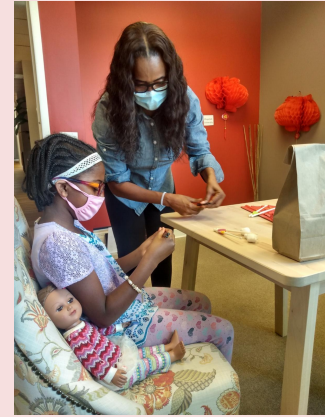
Students and mentors at North Aurora